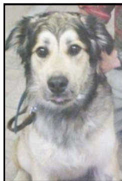
Our Boy Astro